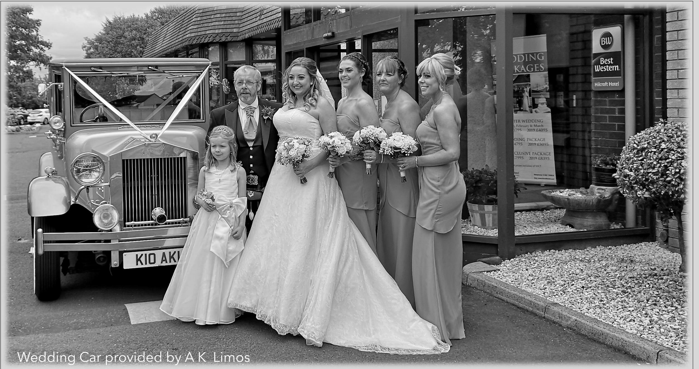
Wedding Car provided by A K Limos